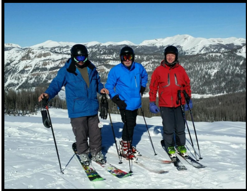
He-men at Wolf Creek, Colorado.

Check out all the photos that some of our SLO Skier members have sent in. They're all having wayyy too much fun! But hey, we're skiers right?