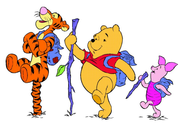
Tiger, Pooh and Piglet getting ready for Park City!