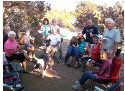
Enjoying the summer evening sitting around the campfire!