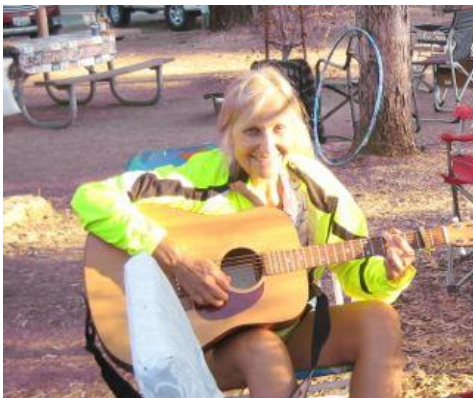
Our talented musicians @ El Chorro Camp/Bike event!