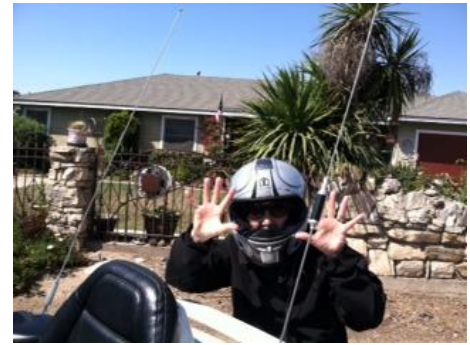
Having Fun on the road!