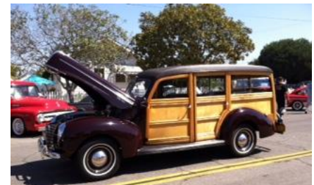
A 1940 "Woody" @ Orcutt Car Show