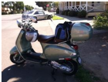
The "little gun"