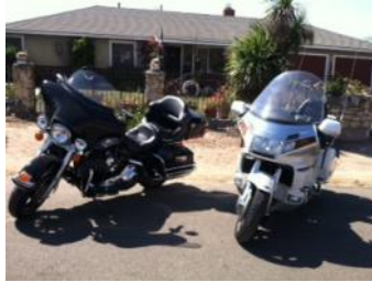
The "big guns"