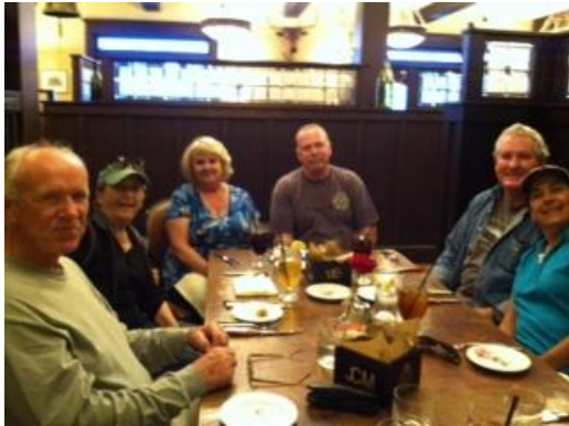
Lunch @ The Far West Tavern in Orcutt!