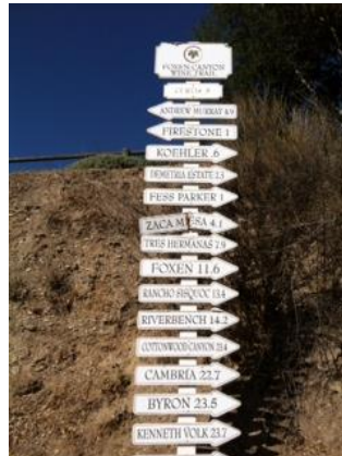
Vineyard back roads