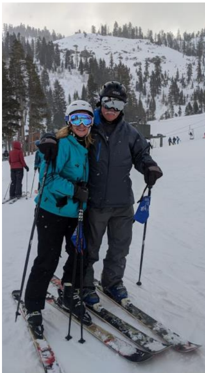
"The Voice of the Western Skier"