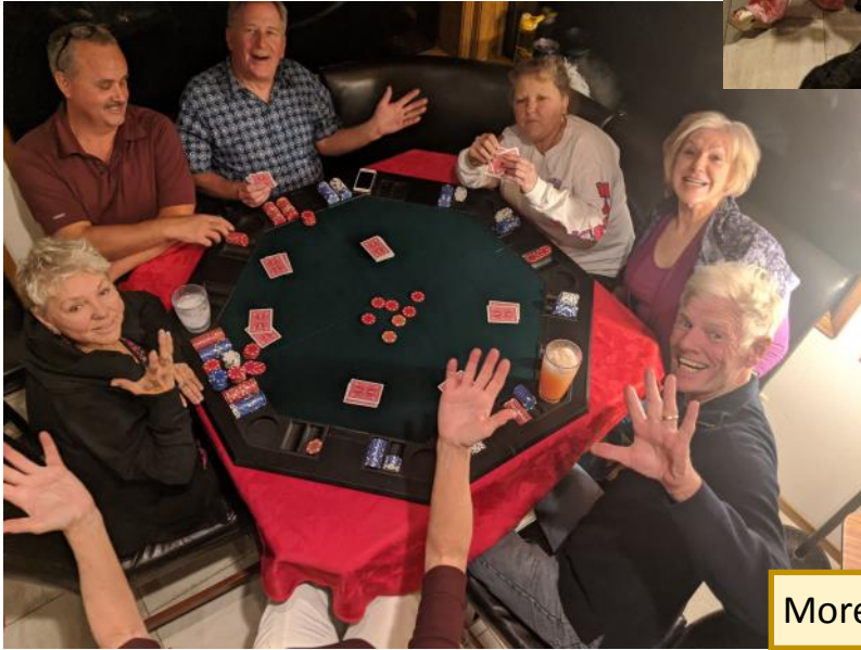
More Hiking! Pismo Preserve