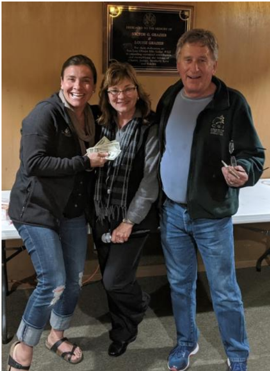
50/50 WINNER! WINNER