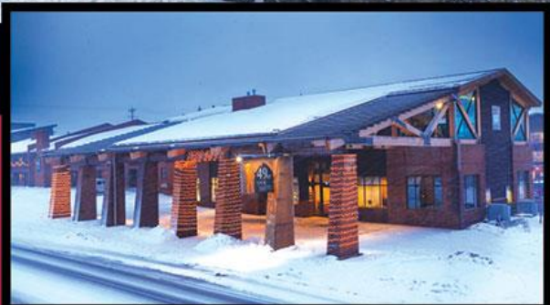
The 49er Inn & Suites